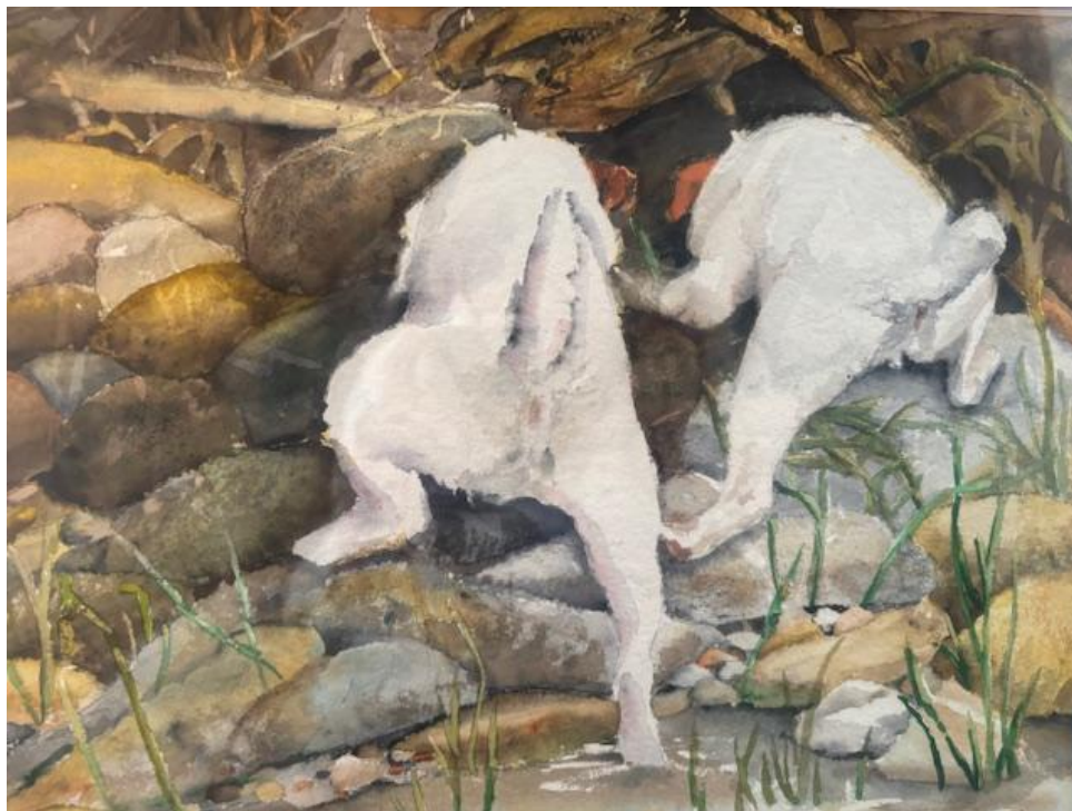
Artwork by: Nedra Jensen

Open to Earthdogs, up to 15" tall, 6 months & Older, who have scored 100% in a Earthdog Novice class at this or previous trials. One second per total feet of tunnel to reach quarry; may leave earth & re-enter once until quarry is reached; work quarry for one minute without a break in work and without leaving quarry.